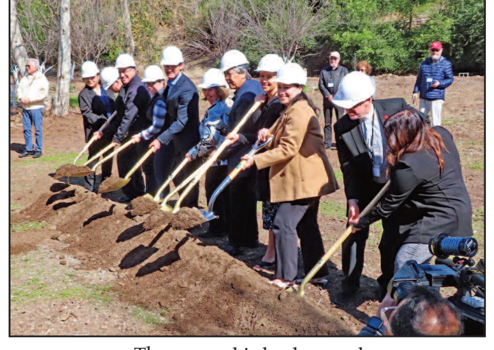
The ground is broken and construction is underway.

The West Valley Food Pantry Community Center will include a new warehouse, distribution room, staff office suites, community work spaces, a community kitchen, and more.