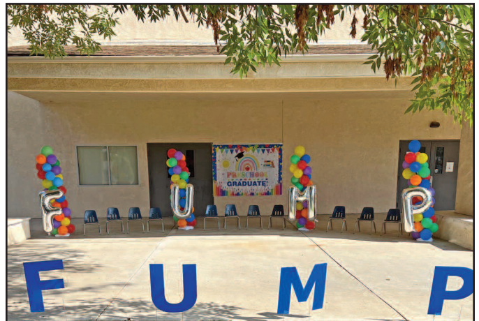
Colorful stage for the June graduation!

Summer school has begun and all the kids are having a great time!