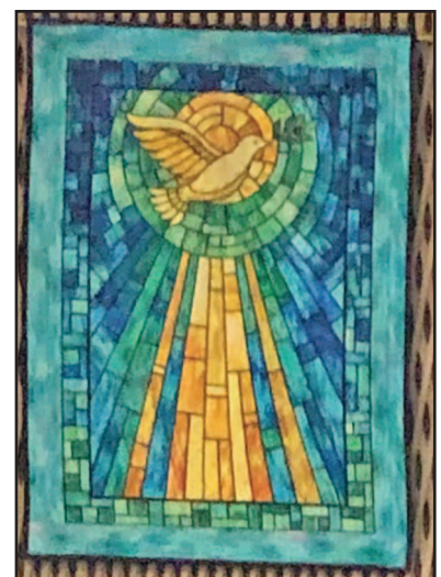
Spirit of Love banner

Wednesday, February 11 at 1:00 pm Church Library