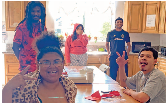
Residents of TAY

Serve wholeheartedly, as if you were serving the Lord, not people. Ephesians 6:7