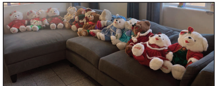
The Bears waiting to be selected