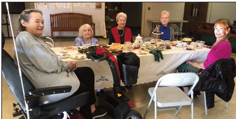
A recent meeting of the Bookends Circle in the Parlor.