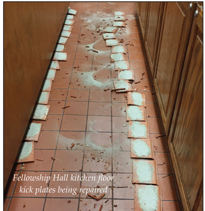
Fellowship Hall kitchen floor kick plates being repaired

Fellowship Hall: Last month I mentioned we were blessed with a designated gift which will enable us to do some maintenance on the FH kitchen. In October we were able to get the numerous kick plate tiles under the kitchen islands replaced along with some floor tiles. We're still looking for