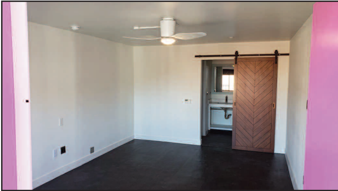
The standard room (above) Beyond the interior (unlockable) door (below)

A group of eight from our church toured the impressive site of a new homeless housing project on Ventura Blvd. across from Taft High School. We didn't know the property which Hope The Mission purchased included the old Denny's that was right next to the converted 818 motel. The plan is to open the 100 housing units in late May.