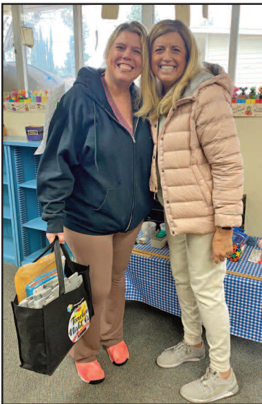
Some items went to the preschool at the Northridge UMC