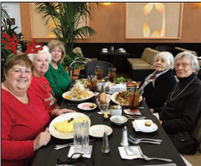
Bookends at their December dinner out

servicing. Many compliments have been received.