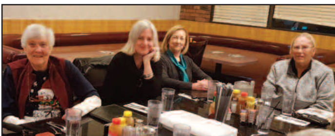
Faith, Hope & Love Circle at their December meeting