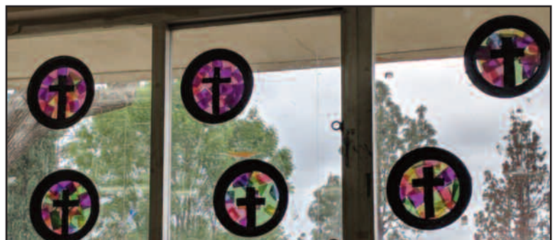
Easter paper mosaic art in the Preschool windows